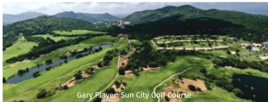
Gary Player: Sun City Golf Course

Breakfast at the lodge and early transfer to Sun City (30 minutes) to be ready to play at the Gary Player Course. After your game you can decide to enjoy the Sun City facilities or return to the lodge and relax. Dinner included at the lodge.