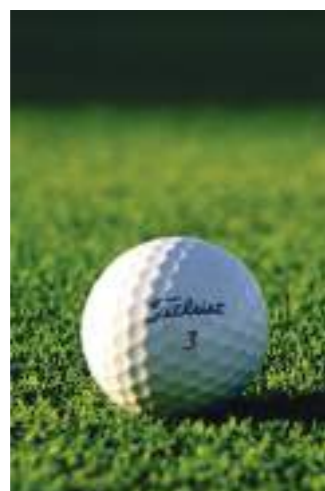
SIGNATURE GOLF COURSES