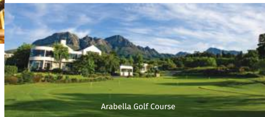
Arabella Golf Course

Breakfast and minibus transfer to Arabella golf Course on the way to Hermanus. (45 min). Experience one of the Cape's top golf courses, ranked top 10 in South Africa. Surrounded by the magnificent Kogelberg mountain range, Bot River Lagoon and edged by wild fynbos, this picturesque Golf Course is the ideal place to pursue a passion for golf. We will finish the day in driving to Hermanus, the official Whale Watching Capital of the World. It is built along the beautiful shores of Walker Bay and is surrounded by majestic mountains, indigenous Fynbos and spectacular natural beauty. We will drive and stay in Stellenbosh and check-in at the Lanzerac Wineries unique estate for a wine treat experience.