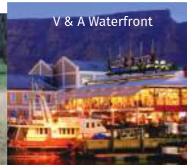
V & A Waterfront

Early morning departure for a sunrise safari. Transfer to Nelspruit Airport and domestic flight to Cape Town (2 hours). Transfer to V&A Waterfront 5* hotel and rest of the day walking in Cape Town. Dinner at leisure