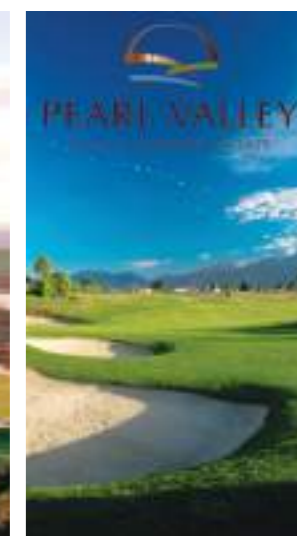
PEARL VALLEY Designed By Jack Nicklaus