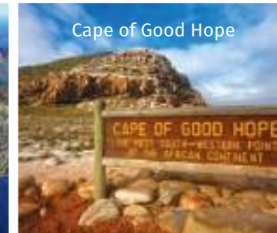
Cape of Good Hope