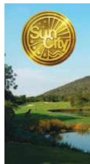
SUN CITY Designed By Gary Player