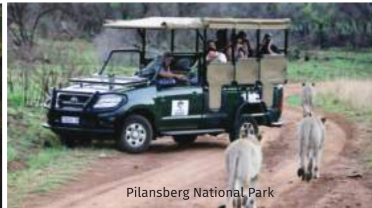
Pilansberg National Park