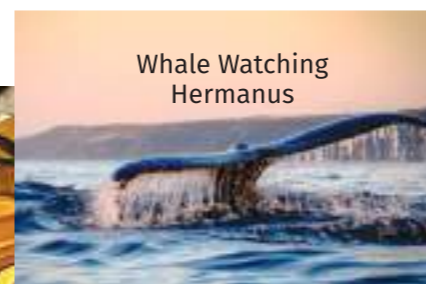
Whale Watching Hermanus

After breakfast we will discover Cape Point Nature Reserve driving toward Cape Point via Camps Bay, Hout Bay, Chapsman's Peak. Then to Cape of Good Hope the southernmost point of Africa. We will take the cable car to the top and can have lunch at the only restaurant of the site that oversees the ocean, a fantastic 360 view over the 2 oceans. Dinner at leisure.