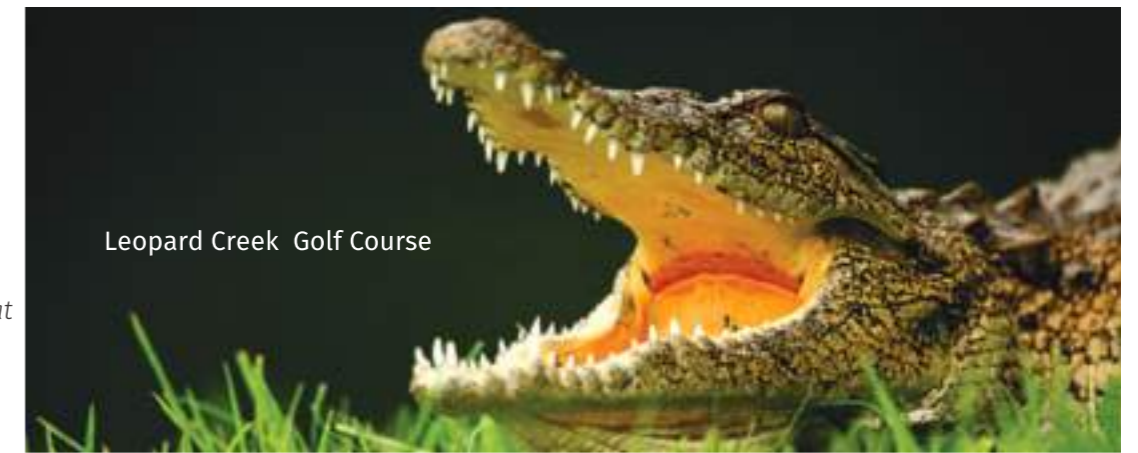
Leopard Creek Golf Course

Transfer (30 min) to the private signature Leopard Creek Golf. Sunset aperitif and walk among giraffes, wild pigs, ostriches, zebras and other wildlife at the Marloth Estate. Dinner at the lodge included.